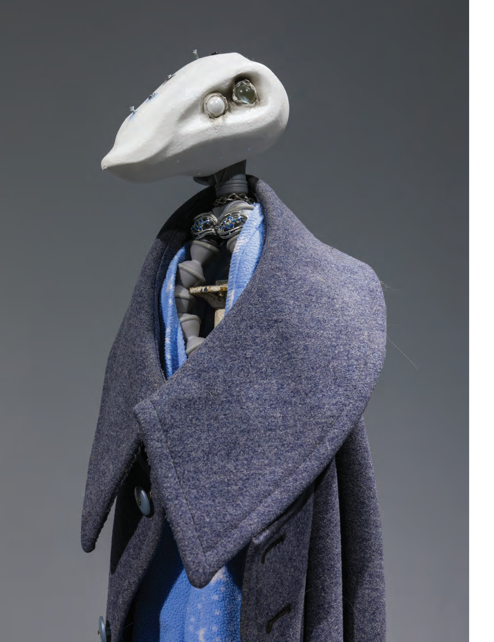
Towering Sentinel, 2019 (detail), installation view, Centinel, Swiss Institute, New York (opposit