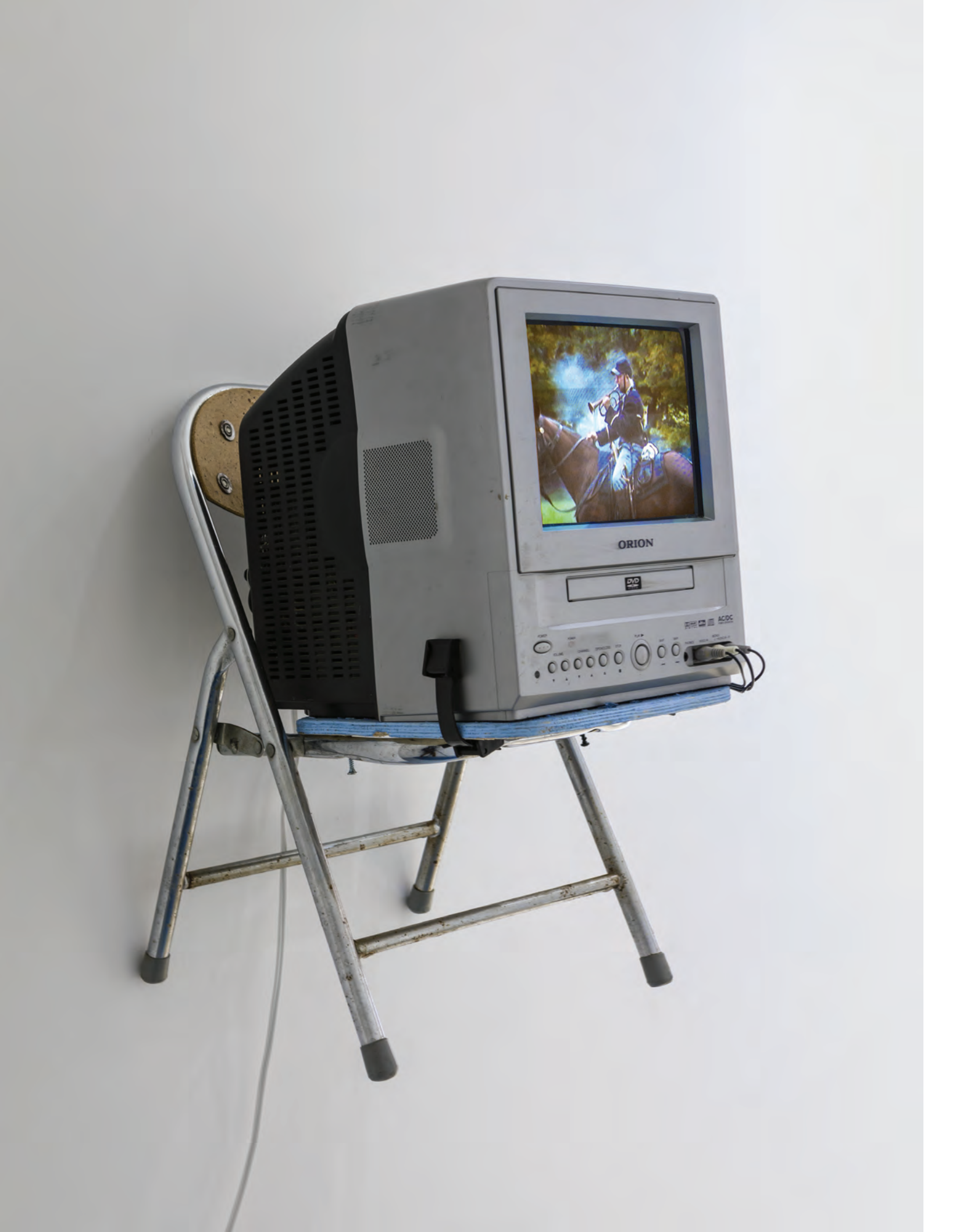
Secure Seat For Meadow Lark, 2019, installation view, Centinel, Swiss Institute, New York (opposite) Aerial view of Grand Meadow School (top