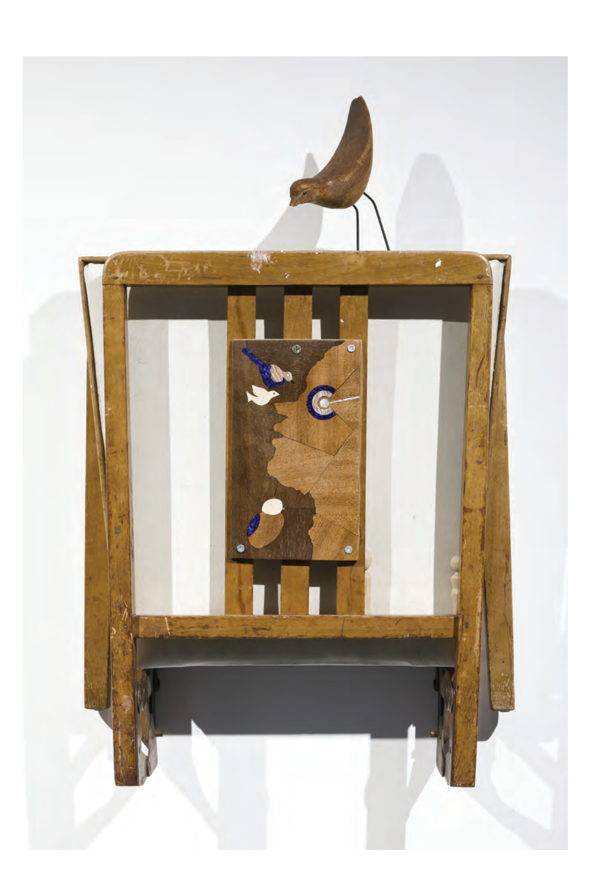
Look Up For Edith, 2019, installation view, Centinel, Swiss Institute, New Y